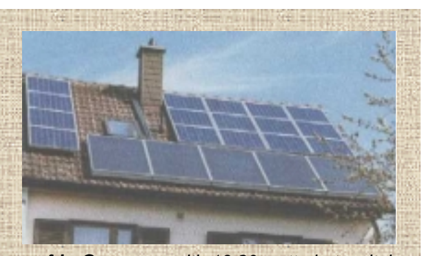
roof in Germany with 16 80-watt photovoltaic panels, which will generate around 1000kWhours of electricity per year — about one third of a family's needs. There are also 5 solar hot water panels at the bottom of the roof, which do not produce electricity — water passes through them and is heated directly.

The electricity produced this way (and also from batteries) flows in one direction only, and so is called direct current, whereas electricity from the UK national grid is alternating current, as the flow of electrons changes direction 50 times per second. Direct current can be stored in batteries to power 12 volt appliances. However, these are more expensive and less readily available than ordinary domestic 240 volt appliances, so batteries and an inverter can be used to convert the 12 volt direct current to 240 volt alternating current, or the panels can be connected to the grid, with a meter to see how much electricity is put into the grid and how