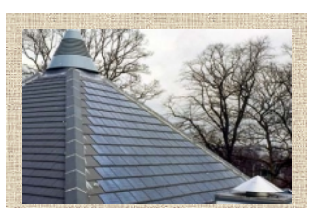
solar roof tiles: 1.56kW of solar tiles installed by Solar Century on a roof in Nottingham.